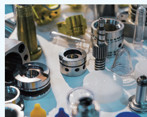
Stainless steel/Fluororesin parts

※Porous medium, hollow tubular, or clothing are not designed to dry. If you intend to sterilize those medium/items, we recommend the "CLG-DVP" series equipped with the vacuum drying function on the page 06.