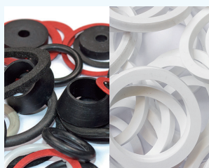
Silicone rubber parts