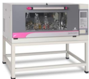
ZWYR-D2401 With P5010-50