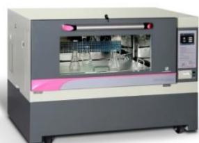
ZWYR-D2401 With P5010-35