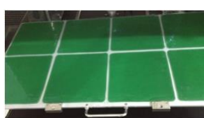
P8017 Sticky Mat