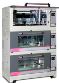
ZWYR-D2403 with P5017