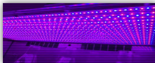
P5011RB: (50% Red, 50% Blue)