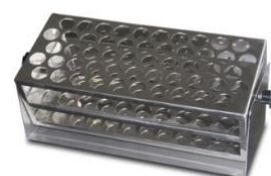
P8010 Test Tube Rack

Labwit quality assurance program demands the continuous assessment and improvement of all Labwit products. Information in this leaflet could thus change without notification and does not constitute a product specification. Please contact Labwit or their representatives if you require more details